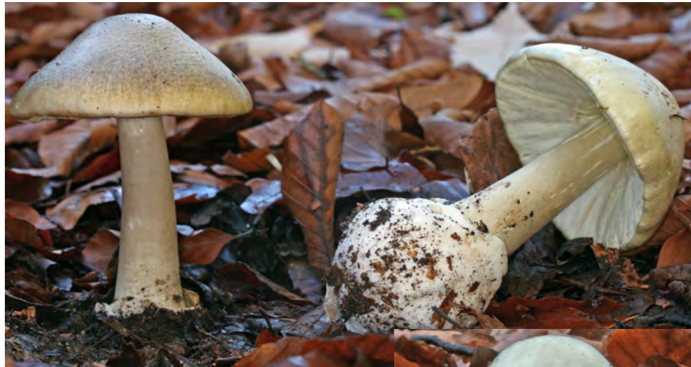
Death cap ( Amanita phalloides )

The death cap is arguably the most dangerous mushroom in New Zealand. Eating just one can kill. When young the mushrooms look like a white ball just at the soil surface. The top then splits and a white to off white mushroom grows out with the remains of the ball forming a cup at the base. The gills are initially covered by a veil but this eventually splits at the edge of the cap and leaves a ring towards the top of the stalk similar to the fly agaric to the right. Young caps are off white or greenish but at maturity can range in colour from off white, light tan or greenish and up to 12 cm across.