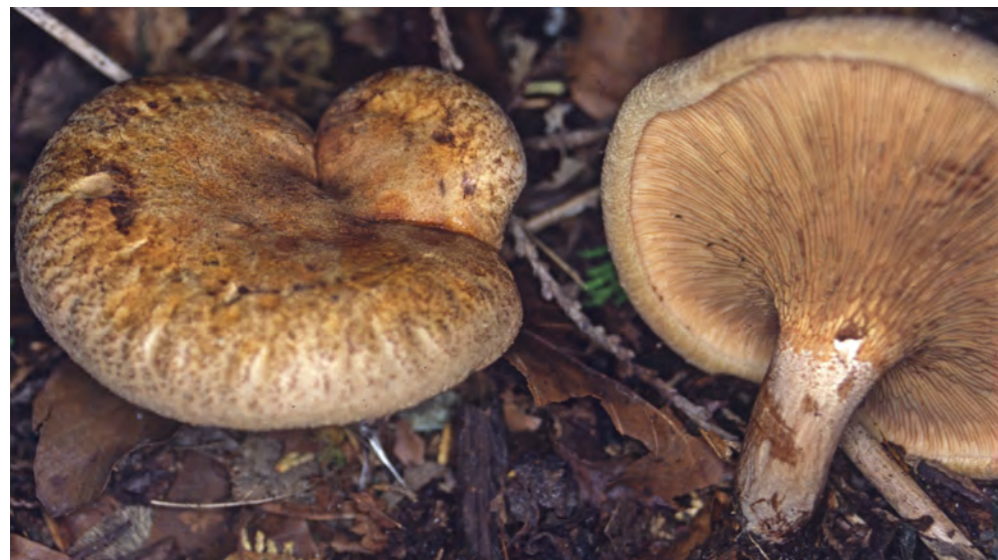
Brown roll rim ( Paxillus involutus )

This mushroom is quite common on introduced hardwoods and softwoods in New Zealand. The caps and gills are buff to light brown and 4 cm to 10 cm in diameter and smell of radish. Many species of Hebeloma and the allied genus Inocybe are poisonous and eating them can result in death. Some of the smaller species fall into the lbm category - little brown mushrooms - a name that covers many difficult to identify species. Novices should never eat lbms.