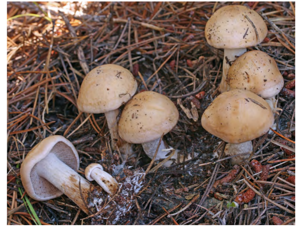
Poison pie ( Hebeloma crustuliniforme )

This mushroom is quite common on introduced hardwoods and softwoods in New Zealand. The caps and gills are buff to light brown and 4 cm to 10 cm in diameter and smell of radish. Many species of Hebeloma and the allied genus Inocybe are poisonous and eating them can result in death. Some of the smaller species fall into the lbm category - little brown mushrooms - a name that covers many difficult to identify species. Novices should never eat lbms.