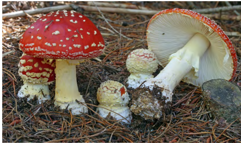
Fly agaric ( Amanita muscaria )

The fly agaric, although widely illustrated in children's books, is poisonous and eating it can cause nausea, vomiting, diarrhoea and hallucinations. Young mushrooms (right) might be mistaken for an edible puffball. At maturity (above) fly agarics can be as large as a dinner plate and can lose some or all of their white spots. Placing pieces of the dried mushroom in a saucer of milk will attract flies which become intoxicated, fall off the mushroom and drown in the milk.