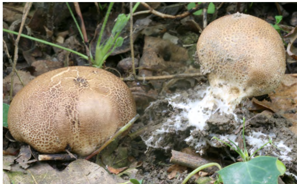
Earthballs ( Scleroderma sp.)

Most of the earthballs have a stalk at the base. They have a thick skin and a light brown centre when young but as they age the insides gradually turn dark brown or black and filled with dry dusty spores. Some species are very toxic producing unconsciousness, nausea, severe abdominal pain, vomiting, perspiration, tingling sensations, spasms, cramps, paralysis and anaphylactic shock.